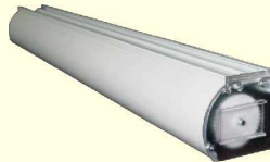
RB32A-2 RB38A-2 RB42A-2

NEW 32mm, 38mm, 42mm Control Mechanism and Turn-Around End cap